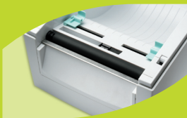
Simple to maintain